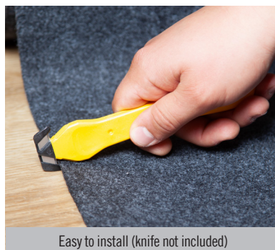
Easy to install (knife not included)